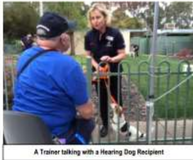
A Trainer talking with a Hearing Dog Recipient

In the demonstration, the trainer of the dog stood well away from the dog and when the phone rang, the dog moved to the trainer and accompanied her back to the phone and immediately received a "reward" (some food pellets that it would seem are carried by an owner at all times.) The reward is central to the training system and is consistently followed through in the later day-to-day life of the owner and their hearing dog.