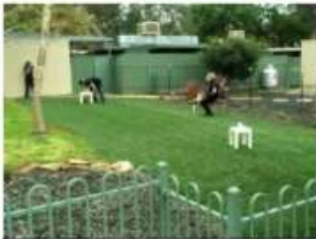
Staff preparing dogs for outdoor demonstration on the lawns in front of the Centre

The Lions Hearing Dogs Open Day, held at the Lions Dog Training Centre in Verdun in October, turned out to be really worthwhile. We went on the recommendation of members who had visited previously. There's no doubt about the difference between seeing what is involved in the training of the dogs and just reading or hearing about it.